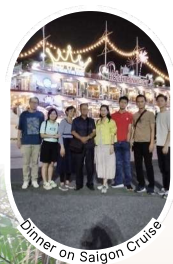
Dinner on Saigon Cruise